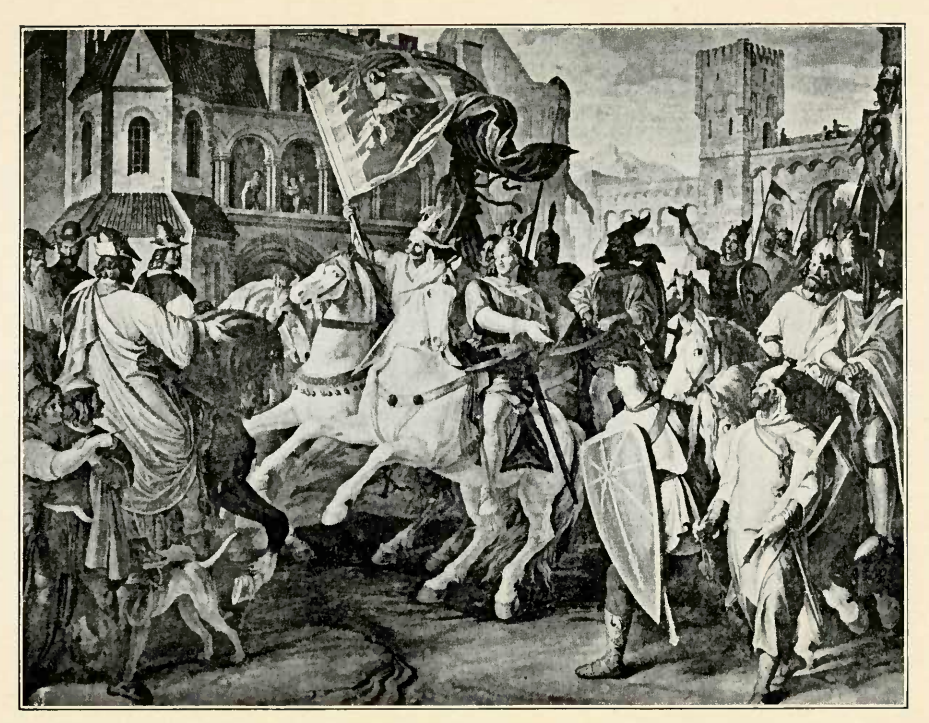
SIEGFRIED'S TRIUMPHANT ENTRY INTO BURGUNDY WITH CAPTIVES AND SPOILS