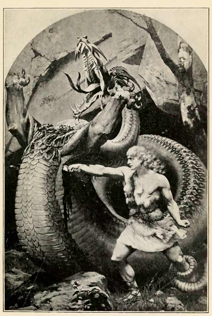
SIEGFRIED FIGHTING THE DRAGON