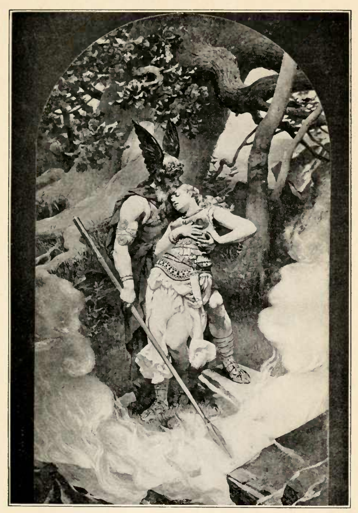
Wotan's Farewell to Brunhilde