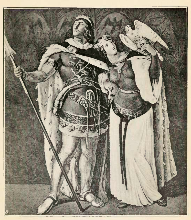
SIEGFRIED AND KRIEMHILD