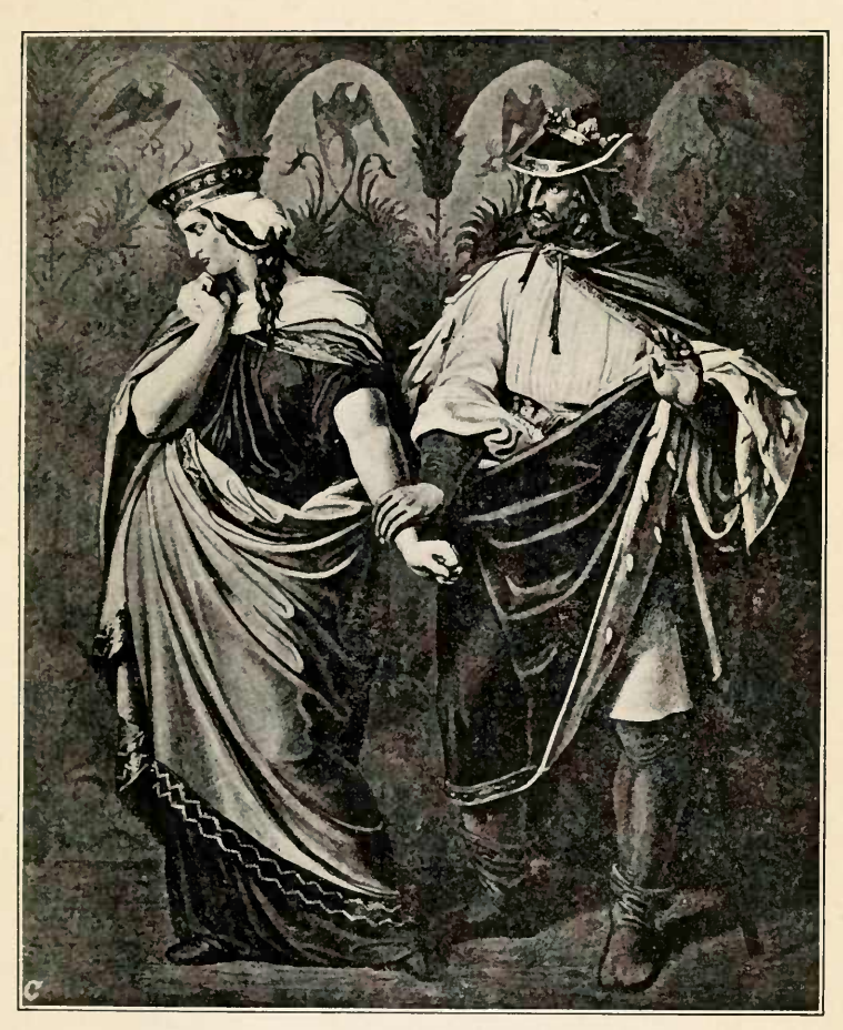
GUNTHER AND BRUNHILDE