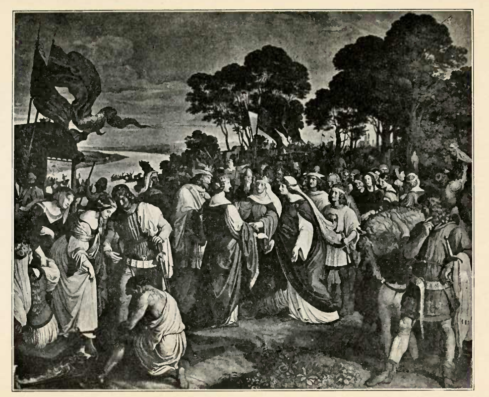
GUNTHER AND BRUNHILDE ARRIVE AT BURGUNDY AND ARE RECEIVED BY KRIEMHILD