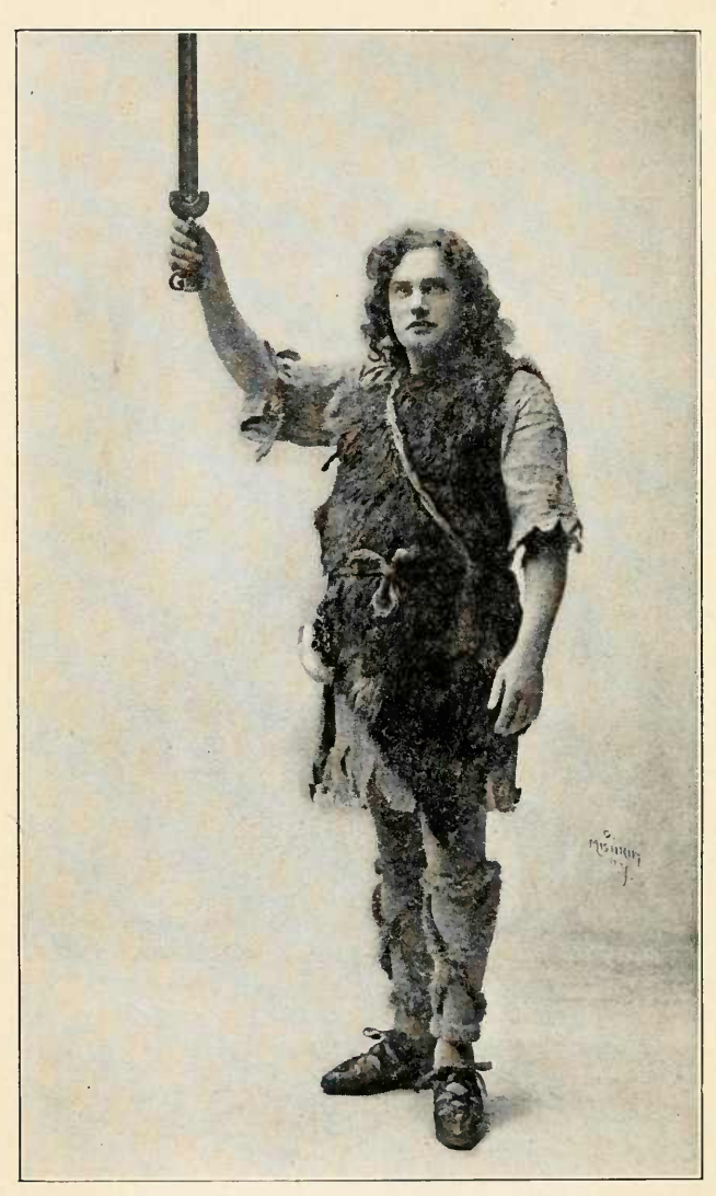
SIEGFRIED AND THE FAMOUS SWORD BALMUNG