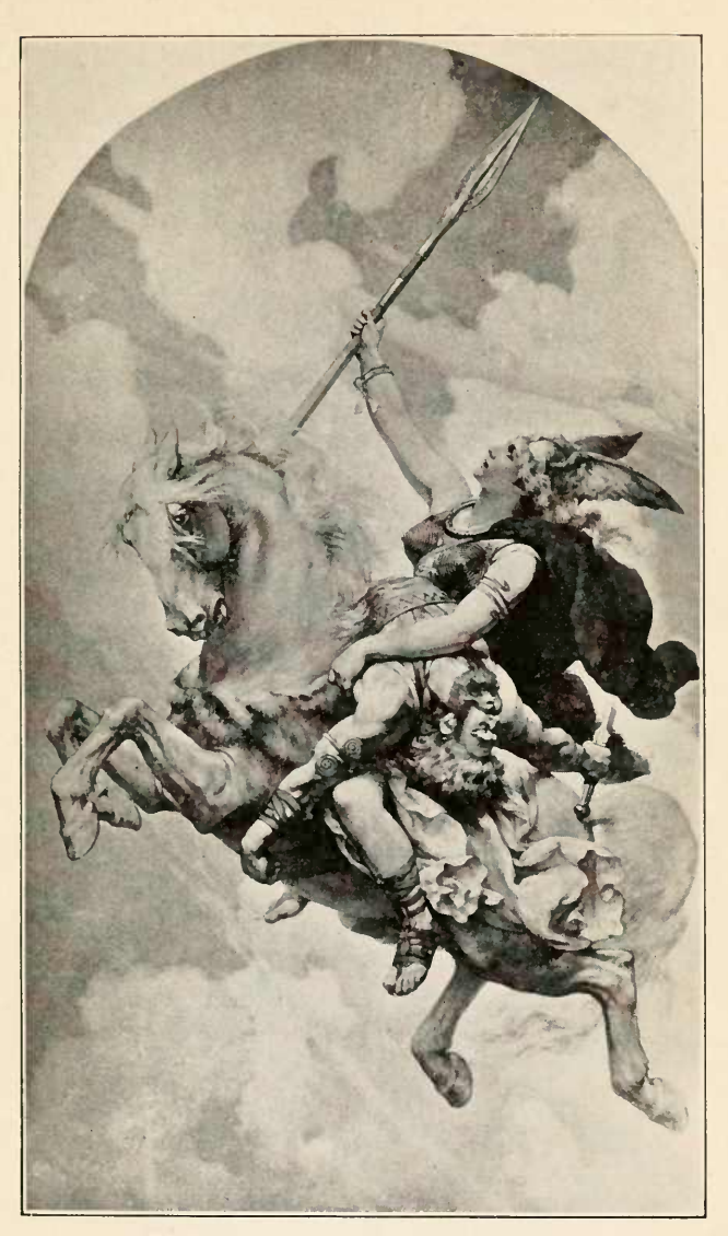
VALKYRIE BEARING HERO TO VALHALLA