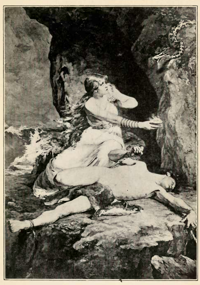
LOKI AND SIGYN